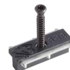
Cobra Hybrid 8-18 (90 clips + screws) 1 bag for 4.5 m 2 (138mm)